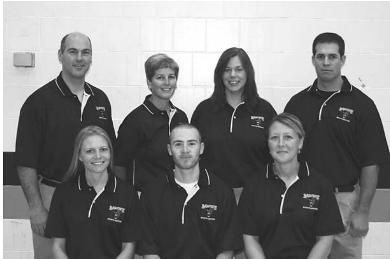
2007 ATHLETIC TRAINING STAFF

Allied health care providers are the University's Cutler Health Center, Eastern Maine Medical Center, Orono Medical Center, and St. Joseph Hospital.