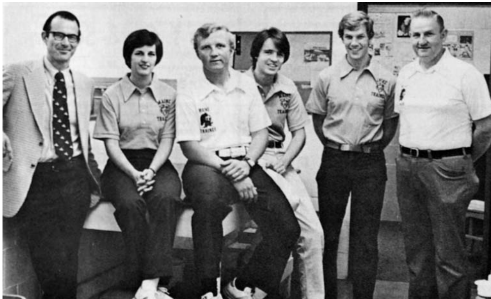
ATHLETIC TRAINING STAFF IN 1980