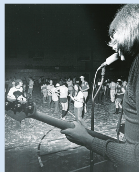
Do you recognize anyone in this photo of a Maine Day dance in the gym in 1974?

Take care of yourselves and drop me a line if there's news you'd like me to share in this column.