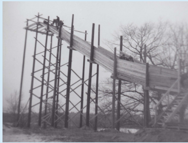
Joe Sala '65, '69G, of Ellsworth, sent this photo, one of a series of photos of members of the ski team constructing a ski jump across the Stillwater River near the steam plant, during Christmas break in 1961. Drop a note to the Class of 1965 correspondent with your email address if you'd like a pdf of the photos.

Remember to email me photos for our photo album, which is on our class page at UMaineAlumni.com .