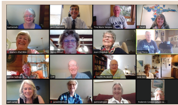
The Class of 1960's virtual Reunion took place via Zoom last September. Alumni from Florida to Maine and other parts of the country were able to watch presentations and visit with each other.